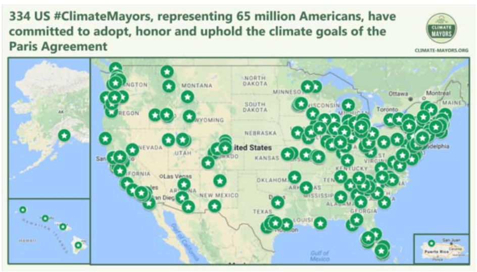
Map Updated as of 6/26/2017