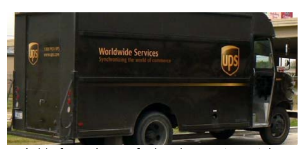
Aside from cleaner fuel and a greater uptake of EVs and hybrids, UPS is also poised to invest heavily in solar and wind power.