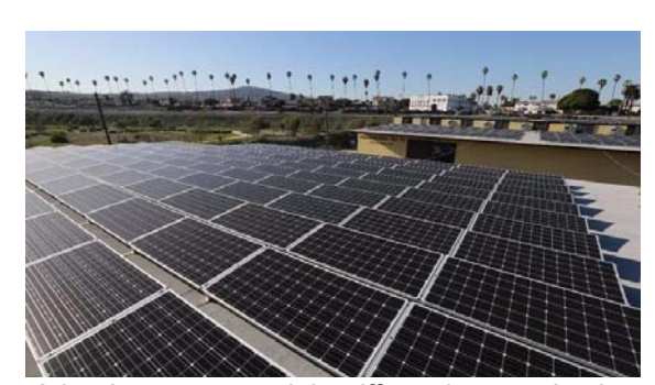
A battle over potential tariffs on imported solar panels has caused a split in the industry.